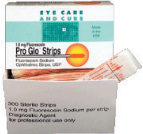
Fluorescein Glo Strips 152F5 $25.00