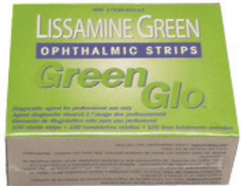
Lissamine Green Strips 152L5 $19.00