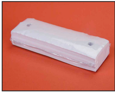
Chinrest Paper 15326 $6.00