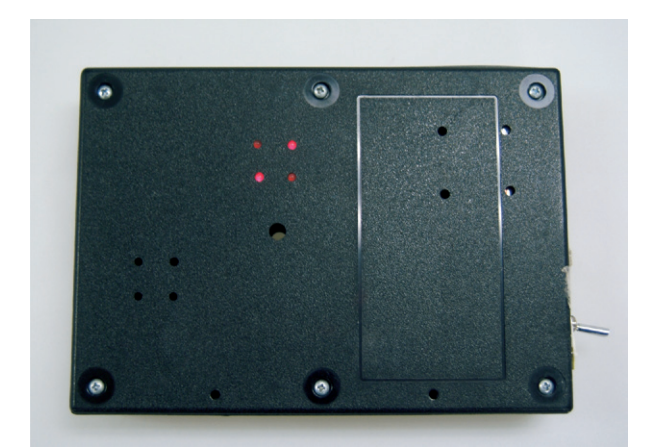
Figure 3 Examiner's view of the LED pattern seen by the patient.