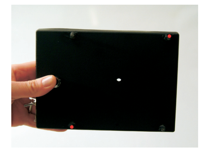
Figure 1 The automated confrontation field tester.

The subject was seated in a darkened room with the left eye occluded and instructed to look at the central peephole with the right eye. The examiner sat at a distance of 60 cm and viewed the subject through the central peephole to ascertain fixation (see Figure 2). At this testing distance, the stimuli, which were 11.25 cm apart, tested the central 15°. The examiner then pressed a button to randomly present from 1 to 4 of the LEDs. Because the device was automated, the examiner had no control over the number and position of the lights that were presented during each trial. The subject then reported the number of lights seen. The examiner then recorded the subject's responses based on the red diodes that lit up on the rear panel of the device (see Figure 3). If the subject's response was correct, another presentation was performed until 4 presentations were completed. If the subject missed 1 or more of the stimuli, the subject was then asked to state the location of the lights seen, to ascertain which stimuli were missed for purposes of recording the responses on a recording sheet (see Figure 4). However, in all, only 4 presentations were performed in total per eye. After the right eye was tested, the subject then occluded the right eye, and the left eye was tested. Missing any light